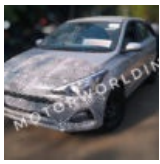
Scoop – 2018 Hyundai i20 Spied Inside-out (Video Included)