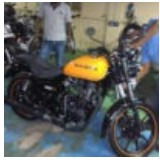
Spotted – Royal Enfield Thunderbird 500X