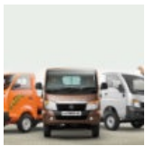
TATA ACE Crosses 20 Lakh Sales Milestone