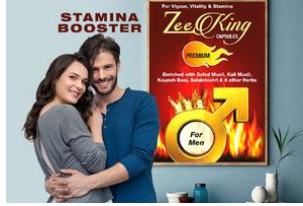
Improve your vigor, vitality & stamina. Year end sale @61% ZEEAYURVEDA