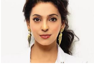
Actresses who rejected roles opposite the Khans BOLLYWOODUNION