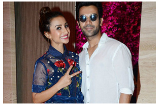
Rajkummar Rao and Patralekhaa's love story Times of India