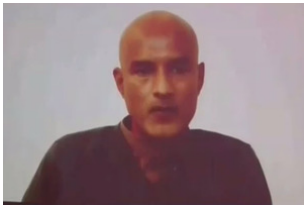
Pakistan releases new video of Kulbhushan Jadhav Times of India