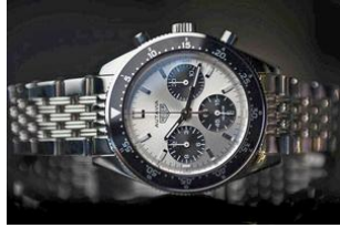
Discount offer! Flat 80% off @ ROLEX watches. Royal Watches