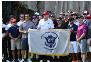
Donald Trump invites Coast Guard members to play golf Times of India