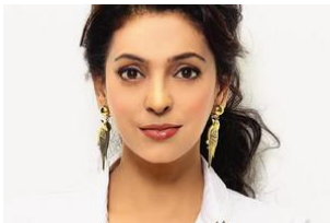
Actresses who rejected roles opposite the Khans BOLLYWOODUNION