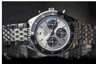
Discount offer! Flat 80% off @ ROLEX watches. Royal Watches