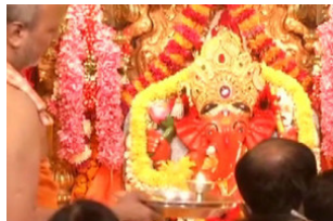
Special 'aarti' performed at Siddhivinayak Temple Times of India