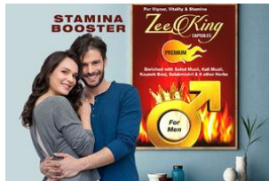
Improve your vigor, vitality & stamina. Year end sale @61% ZEEAYURVEDA