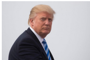
US may deny millions in aid to Pakistan Times of India Recommended By Colombia