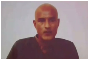
Pakistan releases new video of Kulbhushan Jadhav Times of India